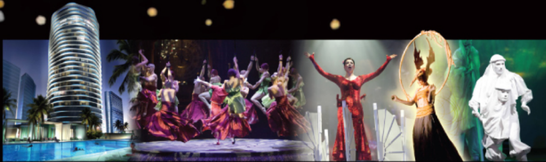
City of Dreams