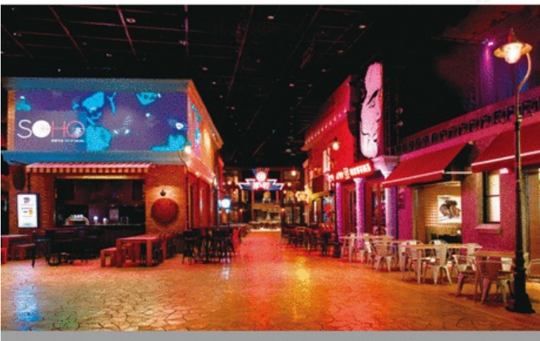
Featuring 16 restaurants and bars and daily live performances, SOHO at City of Dreams

Income tax expense for the six months ended June 30, 2014 was primarily attributable to the Macau Complementary Tax of US$2.6 million on gain on disposal of assets held for sale and a lump sum tax payable of US$1.4 million in lieu of Macau Complementary Tax otherwise due by Melco Crown Macau's shareholders for dividends distributable to them by Melco Crown Macau, partially offset by deferred tax credit of US$1.9 million. The effective tax rate for the six months ended June 30, 2014 was 0.8%, as compared to a negative rate of 0.7% for the six months ended June 30, 2013. Such rates for the six months ended June 30, 2014 and 2013 differ from the statutory Macau Complementary Tax rate of 12% primarily due to the effect of change in valuation allowance, expenses for which no income tax benefit is receivable for the six months ended June 30, 2014 and 2013 and the effect of a tax holiday of US$60.7 million and US$58.4 million on the net income of our Macau gaming operations during the six months ended June 30, 2014 and 2013, respectively, which is set to expire in 2016. Our management does not expect to realize a significant income tax benefit related to deferred tax assets generated by our Macau operations; however, to the extent that the financial results of our Macau operations improve and it becomes more likely than not that the deferred tax assets are realizable, we will be able to reduce the valuation allowance through earnings.