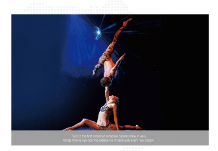
Food, beverage and others. Other non-casino revenues (including the retail value of promotional allowances) for the six months ended June 30, 2014 included food and beverage revenues of US$40.6 million and entertainment, retail and other revenues of US$53.0 million. Other non-casino revenues (including the retail value of promotional allowances) for the six months ended June 30, 2013 included food and beverage revenues of US$37.9 million, and entertainment, retail and other revenues of US$45.9 million. The increase of US$9.8 million in food, beverage and other revenues from the six months ended June 30, 2014 to the six months ended June 30, 2014 was primarily due to higher business volumes associated with an increase in visitation during the period, as well as the improved yield of rental income at City of Dreams.